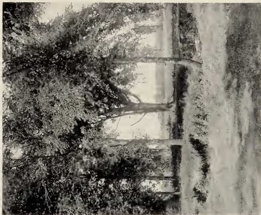
FIG. 2. General view of Kingfisher Environment.